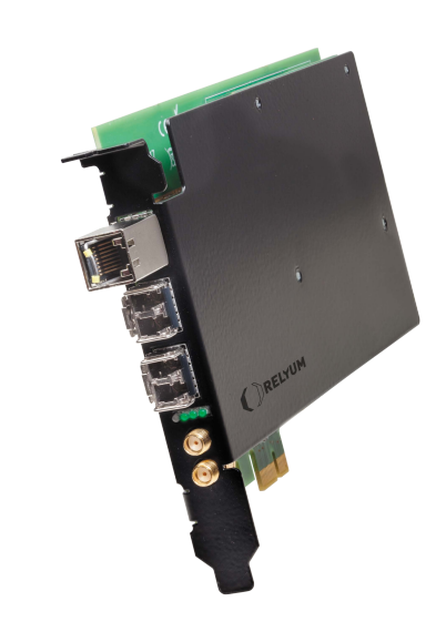
Figure 3 RELY -SYNC-HSR/PRP-PCIe card plugged on the PC Server.

operation as shown in Figure 4. That is all!